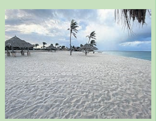
ministry in charge of Infrastructure reminds everyone to take care of Aruba beaches that are part of our cultural heritage.

The DOW added sand to three well-known beaches, namely Arashi, Boca Catalina y Eagle Beach to combat erosion. DOW started with the project on November 9, 2021, at Arashi, followed by Boca Catalina and Eagle Beach. They transported approximately 635 yards of white sand to Arashi, 160 to Boca Catalina, and 2400 to Eagle Beach. The beaches were replenished because there were many stones where white sand used to be. Therefore there was less space on the beach. This maintenance work is not done every month but at beaches where erosion occurs. With white sand transported from other areas, the beaches are now more accessible for beachgoers to enjoy. The